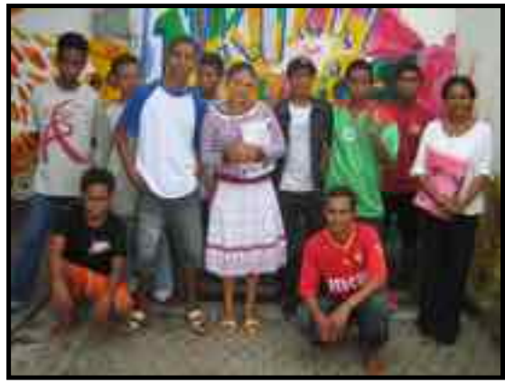
Becora Prison Workshops

Portuguese colonization and Japanese occupation during World War II (where more than 40,000 people died in just three years) which was followed by 24 years of brutal Indonesian occupation. As a consequence of the immense loss of life through extrajudicial killings, torture and disappearances, in combination with the highest birthrate per capita in the world, Timor-Leste has an extremely young population. Over half of its citizens are under 15 years of age and more than two-thirds of the population are under 25. One in five citizens is under 5 years of age.<sup>2</sup>