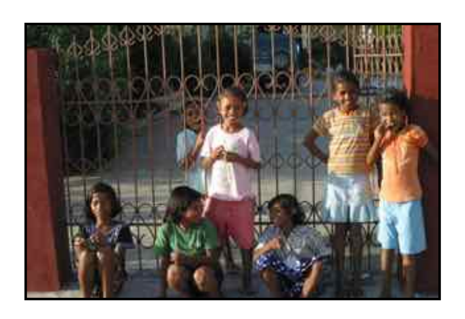
Ba Futuru's Annual Report 2007